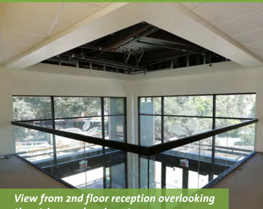
the atrium and main entrance