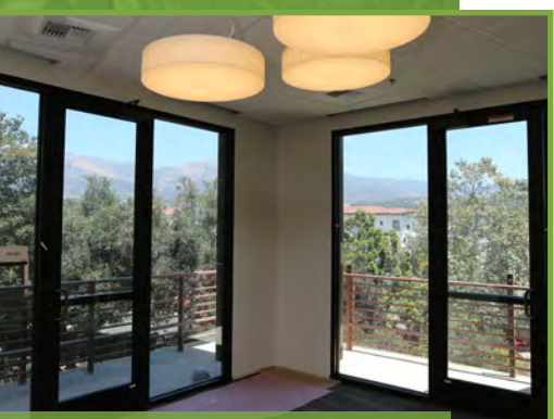
View from 3rd floor reception area with outdoor wrap-around balcony